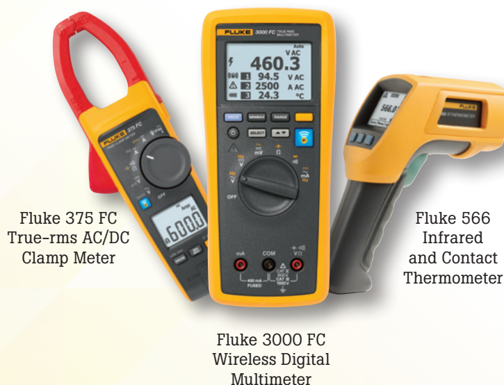
Fluke 375 FC True-rms AC/DC Clamp Meter

up to 7 gifts from Fluke's System Savings Promotion.